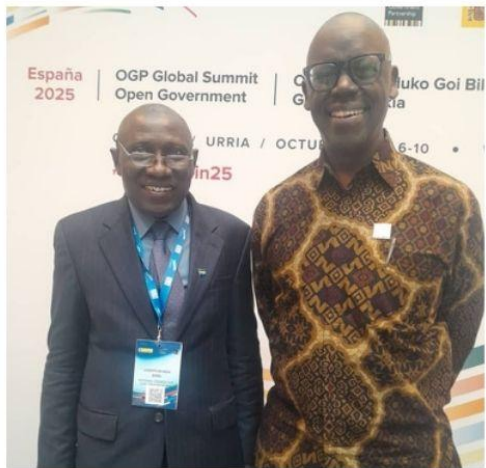
Chairman and the CEO of OGP Global