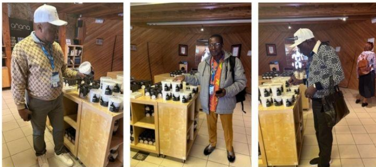
Field visit to the Salt Valley