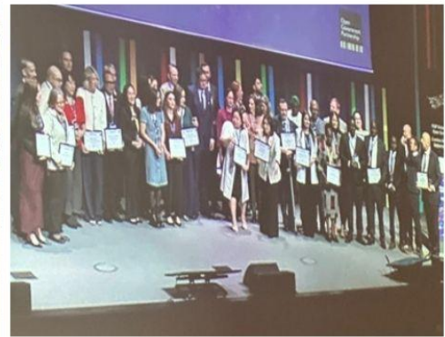
Awardees of Certificate