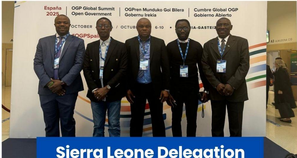
Sierra Leone Delegation