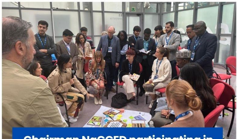
Chairman NaCCED participating in group work at the Summit